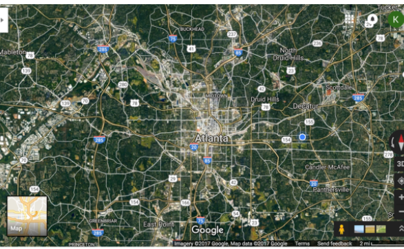
Atlanta reflects our more recent, less dense building